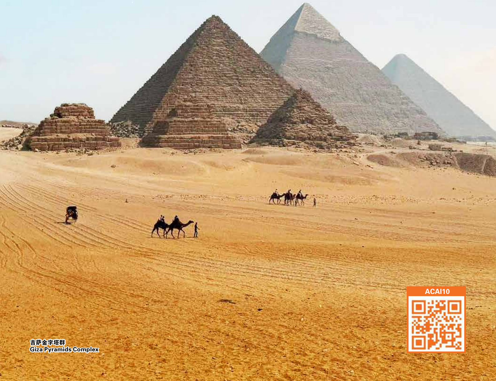
吉萨金字塔群 Giza Pyramids Complex

开罗 | 阿斯旺 | 阿布辛贝勒 | 尼罗河游轮 | 卢克索 | 虎加达 CAIRO | ASWAN | ABU SIMBEL | NILE CRUISE | LUXOR | HURGHADA