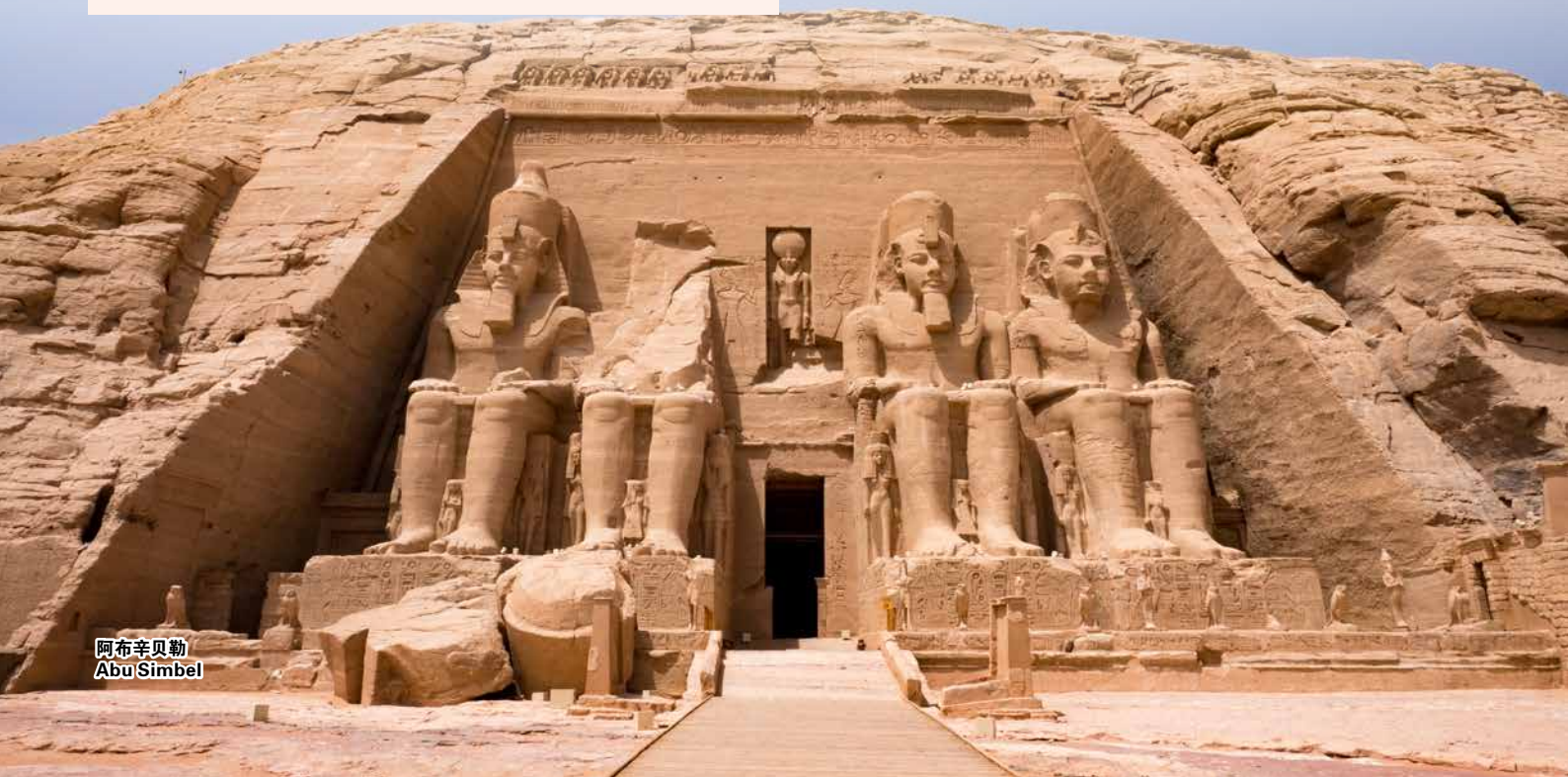
阿布辛贝勒 Abu Simbel